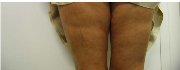
Fig. 1,2 and 3 : Semicircular zones of lipoatrophia on the front of the thighs