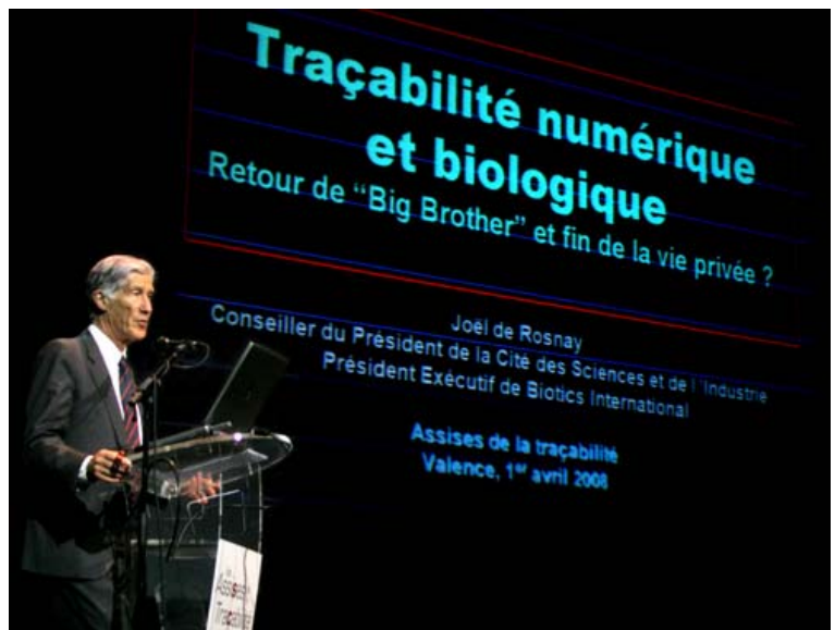
Joel de Rosnay at the assizes of the traceability in Valence.